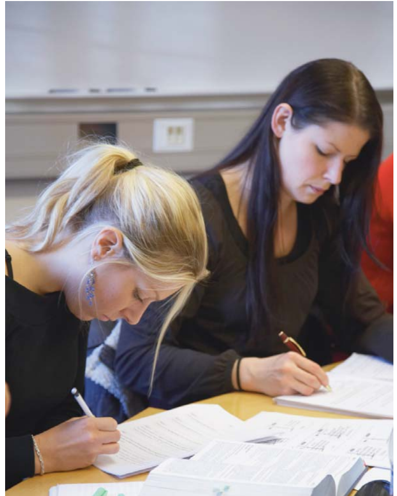
1. Studies at the academy consist largely of group projects, lectures and seminars.